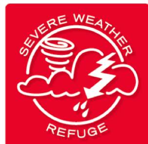
This symbol designates each building's safety refuge.

My friends are able to contact my family in an emergency, if I am unable.